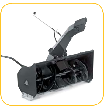
SNOW THROWER, PTO-kit required